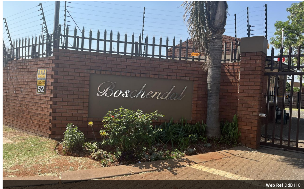
Web Ref DdB118

167 Heidelberg Road Boksburg South Ext.2 Boksburg