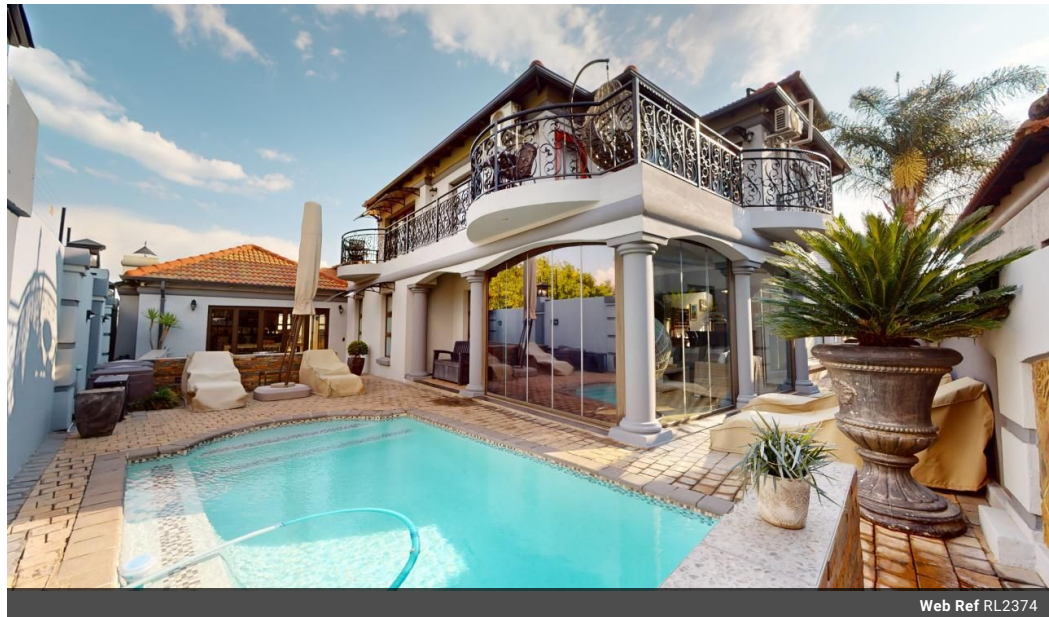
Web Ref RL2374

167 Heidelberg Road Boksburg South Ext.2 Boksburg