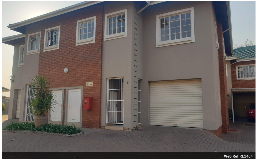
Web Ref RL2464

167 Heidelberg Road Boksburg South Ext.2 Boksburg